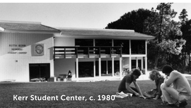
Kerr Student Center, c. 1980