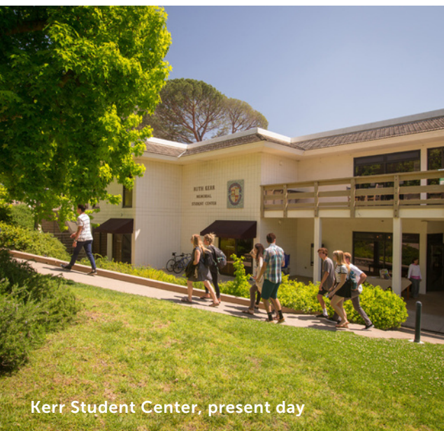
Kerr Student Center, present day